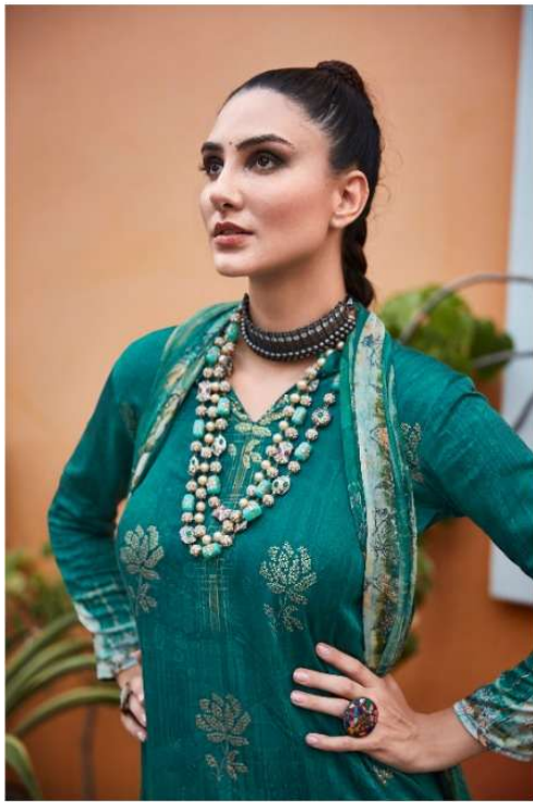
Life is short. Let my paths be long! "Simplicity" 602-001