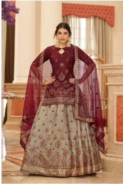
Rare, Eloquent and Alluring, a rich heritage of Indian craftsmanship and tradition unfolds in the new form of lehenga.