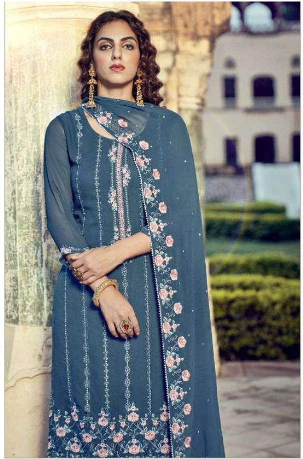
The vibrant colors of this set are Fashion from all over the world.