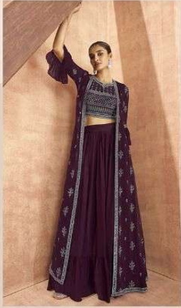
D NO : 9101