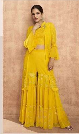
D NO : 9103