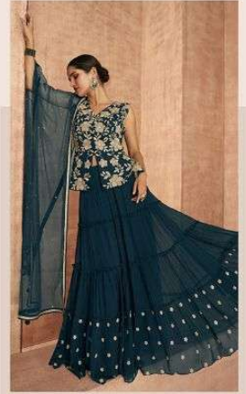
D NO : 9104