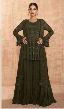
D NO : 9102