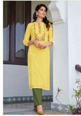
STYLE / 3227