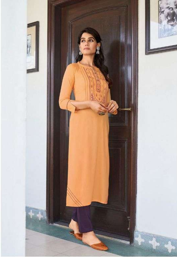
STYLE / 3224 ——— Dictate your style statement with the season's latest trends.