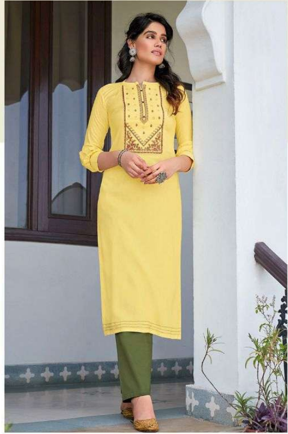
STYLE / 3227 — Rebel in a whole new level of elegance with a touch of exquisite sarees.