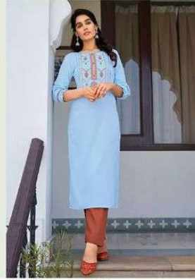
STYLE / 3225