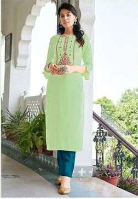
STYLE / 3221