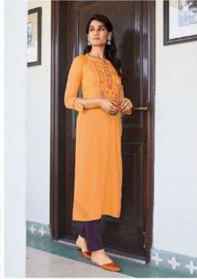
STYLE / 3224