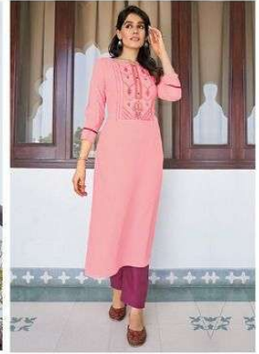
STYLE / 3228