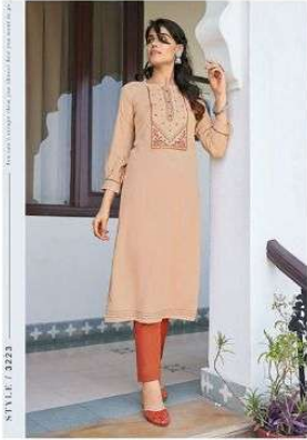
STYLE / 3223