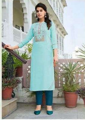
STYLE / 3222