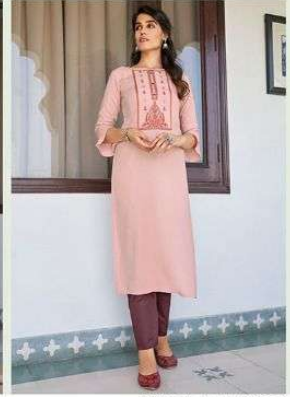
STYLE / 3226