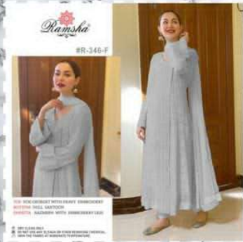
Ransha #R-346-F FOR OCCASIONS WITH ELEGANT EMBROIDERY SILK, FULL LENGTH SLEEVE, MATCHING WITH EMBROIDERY LEAF